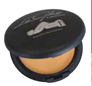
Foto-Finish is a great stand alone foundation but can also be used over LumiGlow cream foundation -the perfect pairing! LaGlam Foto-Finish smoothes your skin while maintaining a radiant matte finish-suitable for all skin types. Minimise pores with great coverage, apply with LaGlam's kabuki brush, probably the softest kabuki brush you will ever use with the perfect density for flawless application.