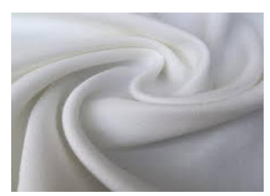
PARTNERS IN NATURAL BEDDING INNOVATIONS