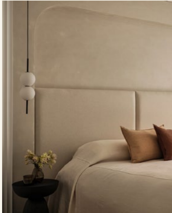
Calla and Lily Design