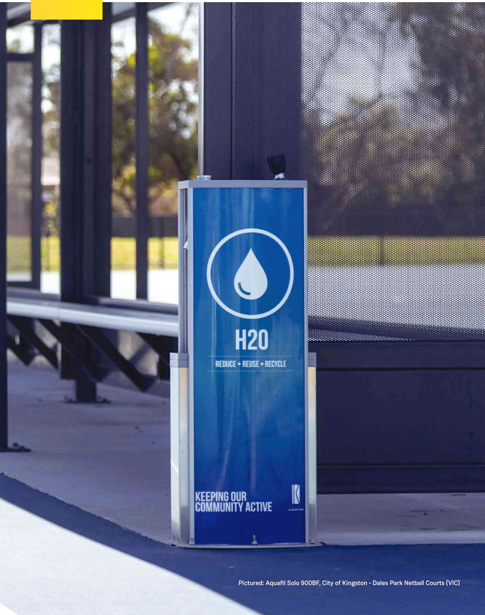
Pictured: Aquafil Solo 900BF, City of Kingston - Dales Park Netball Courts (VIC)