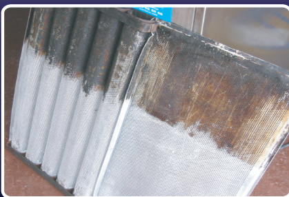
Trays held soaked overnight