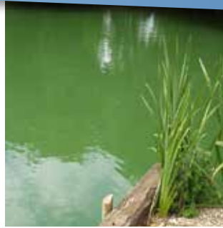
Natural & Safe to use