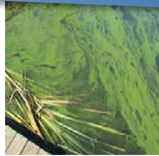
Blue-green algae 1