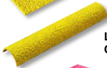
Ladder Rung Covers