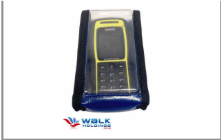
To suit MP70 MinePhone