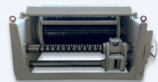
Lift Winch with Arc Screw Wire Guide