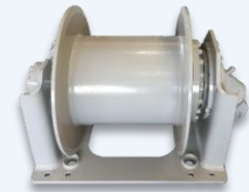
Basic Lift Winch