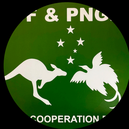
ADF & PNG COOPERATION PROGRAM