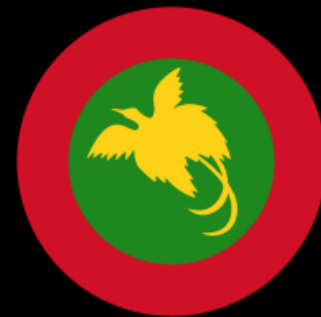
PAPUA NEW GUINEA DEFENCE