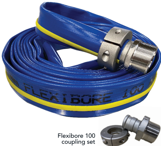
Flexibore 100 coupling set