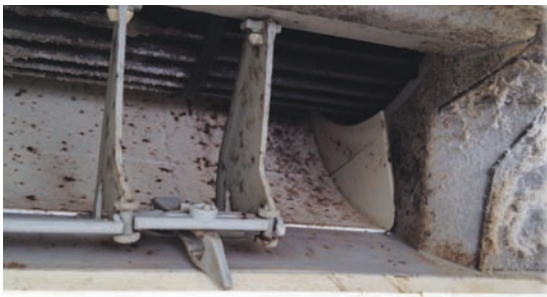
The fan that blows air into the room you occupy (This photo was taken in a Dental Surgery)