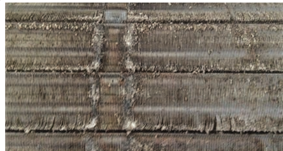
Perfect breeding ground for mould, fungi & bacteria. (This photo was taken in a school).

A HydroKleened Air Conditioner = REDUCED POWER COSTS