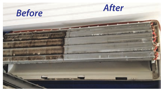
A "Before & After" shot mid HydroKleen