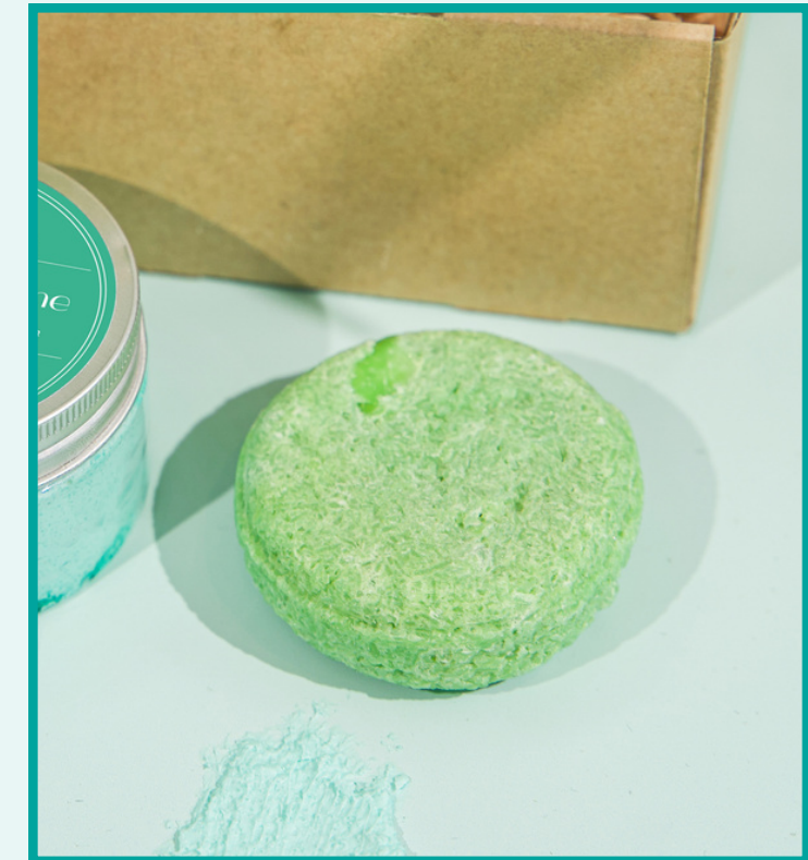
Shampoo Bars & Face/Body Bars