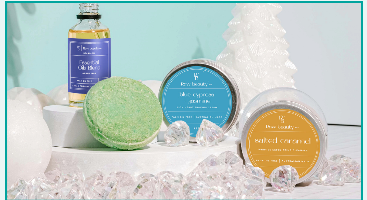
Gift Boxes & Pamper Packs