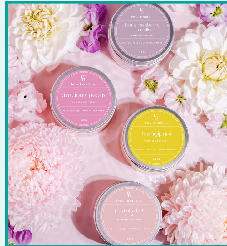
Whipped Soaps & Whipped Scrubs