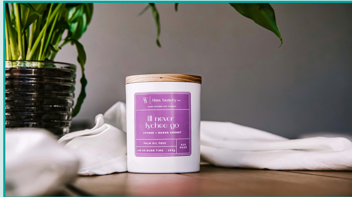
Candles & Wax Melts