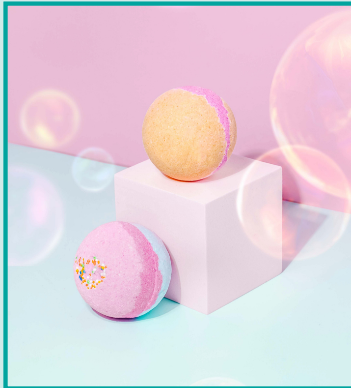
Bath Bombs & Dust Sachets