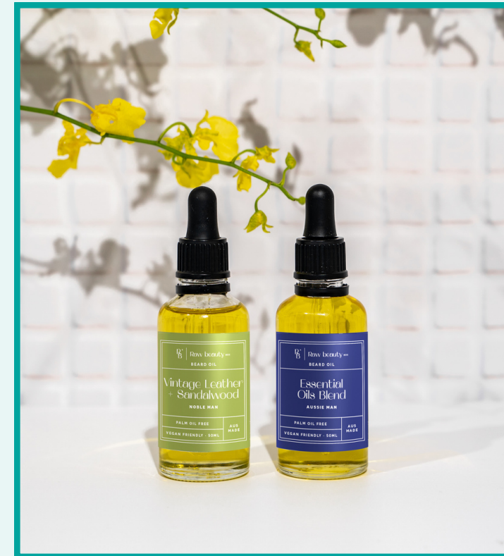
Shaving Cream Beard Oils & Sustainable Razors