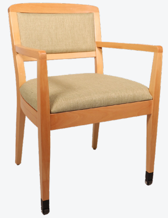
Cura with Castors