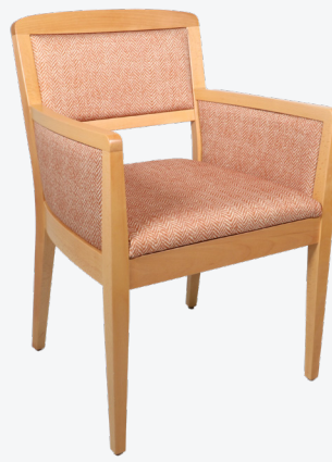
Cura with Side Panels