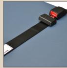
LAP/B Lap Belt