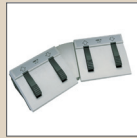
FC-3250 Foot Control FC-3250/2 Foot Control