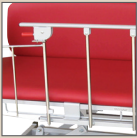
380VRKCT Side Rails