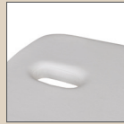
FH Face Hole