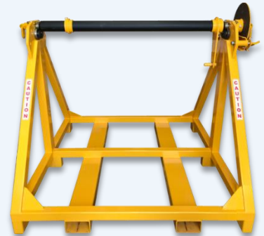
12 Tonne Cable Drum Stand Fully Fabricated and Welded