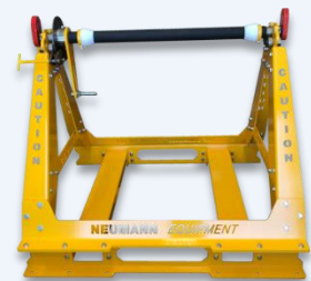
5 Tonne Cable Drum Stand Bolt Together Style