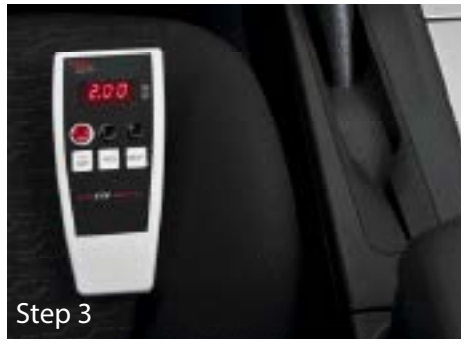
*White unit shown in pictures above. Unit is now black.

AutoTest Products Pty Ltd 63 Parsons Street, Kensington, VIC 3031 Australia tel +613 8840 3000 sales@autotest.net.au