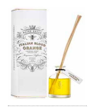
7742 / UNIT QTY 6 Italian Blood Orange Fragrance Diffuser 200ml