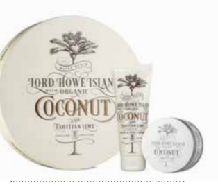
8837 / UNIT QTY 6 Flat Pack Duo Gift Box Hand & Nail Crème 100ml + Body Mousse 150ml