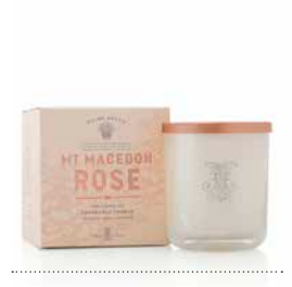
9940 / UNIT QTY 6 Mt Macedon Rose Fragrance Soy Blend Candle 380g