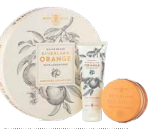
1137 / UNIT QTY 6 Flat Pack Duo Gift Box Hand & Nail Crème 100ml + Body Mousse 150ml