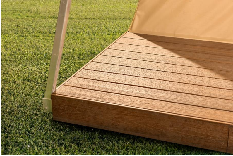
Composite decking and sub frames