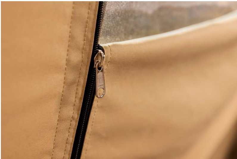
Commercial grade insect screens & zips