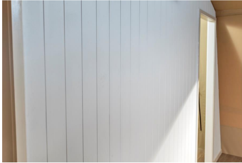
VJ wall panels