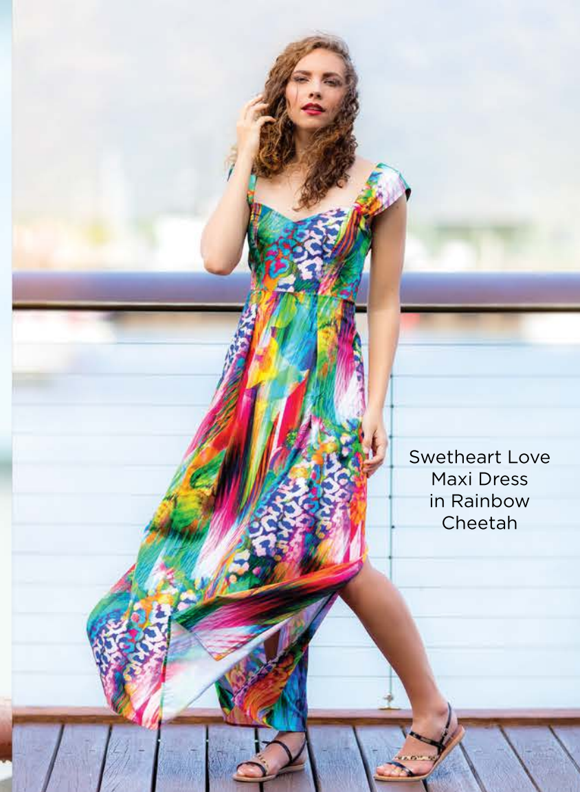
Sweetheart Love Maxi Dress in Rainbow Cheetah