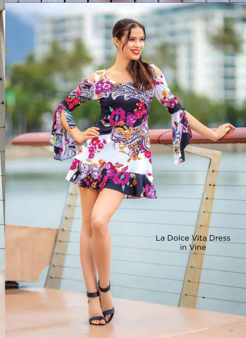
La Dolce Vita Dress in Vine