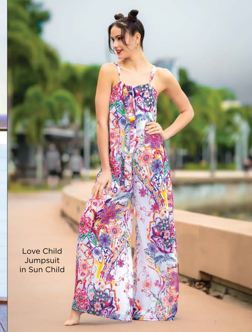
Love Child Jumpsuit in Sun Child