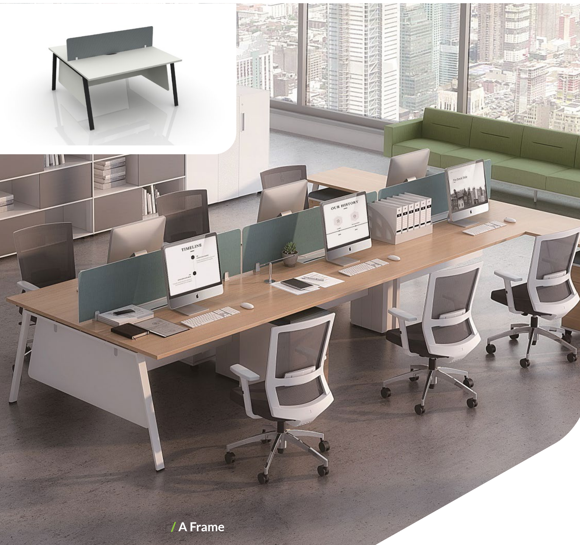
/ A Frame