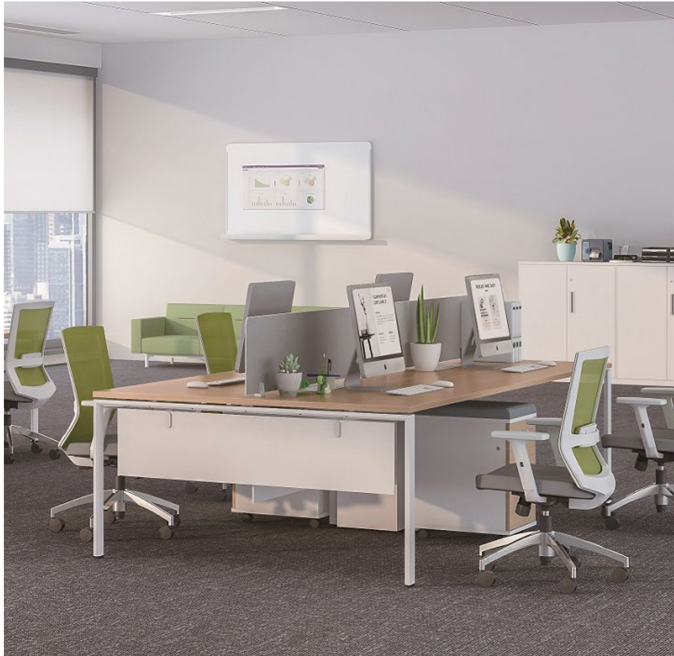
/ U Frame