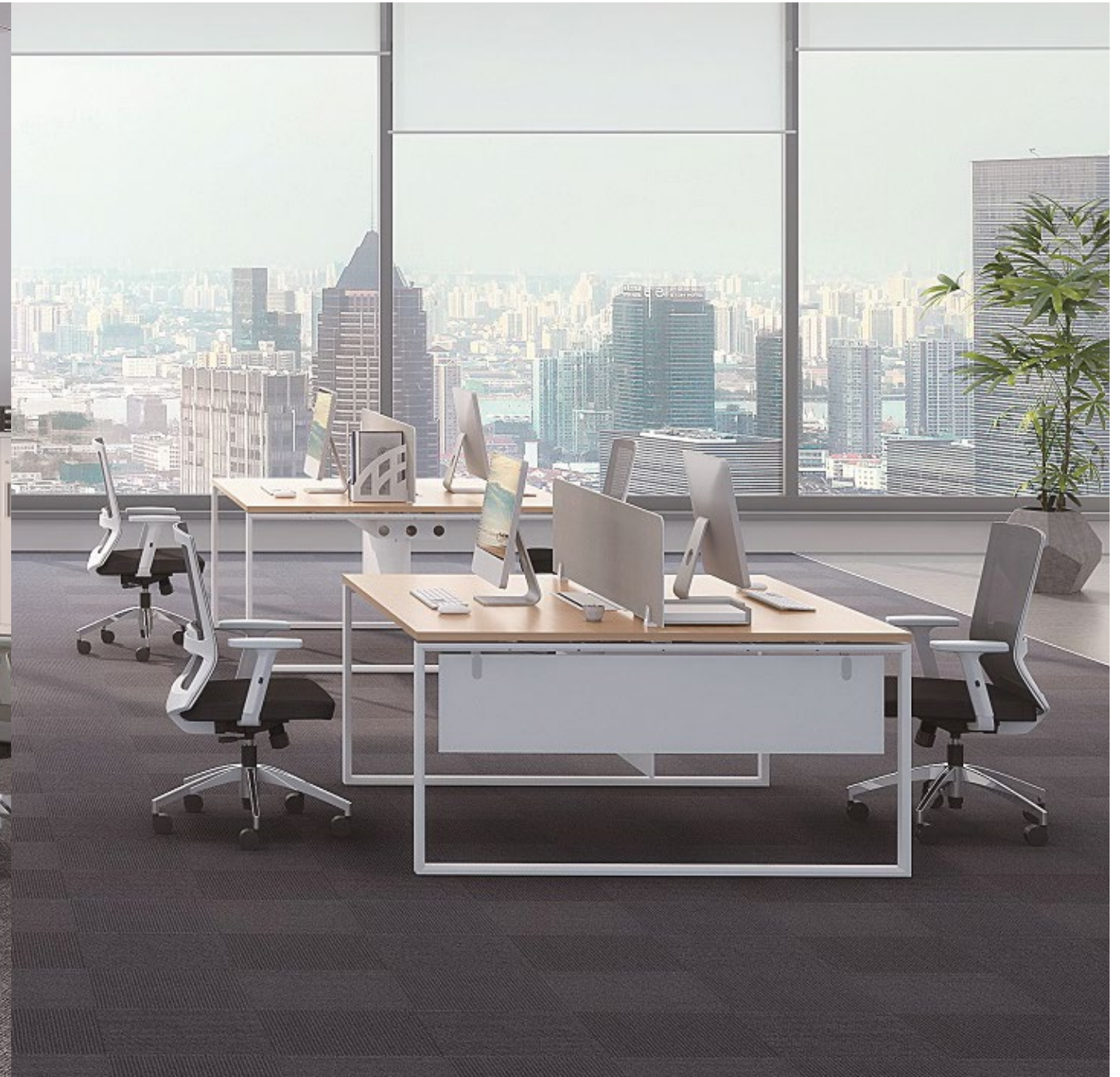
/ Hoop Frame