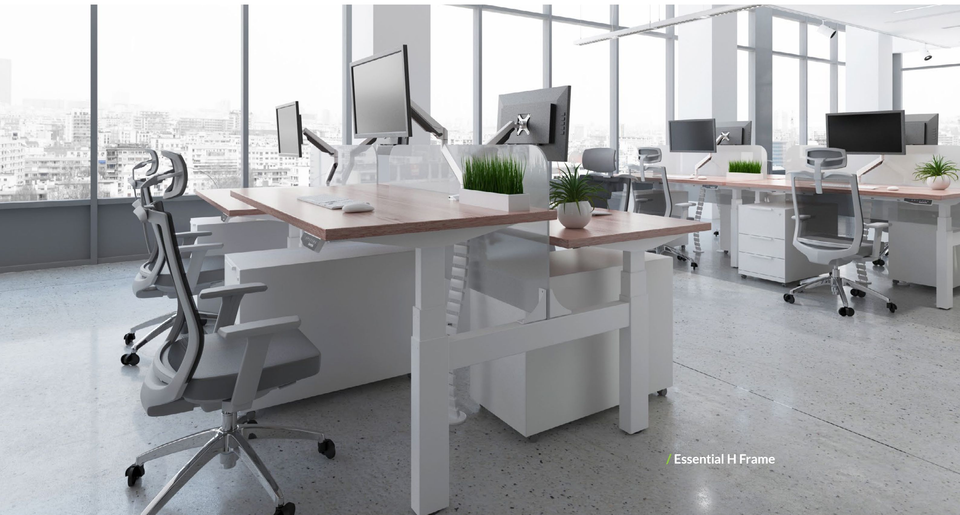
/ Essential H Frame