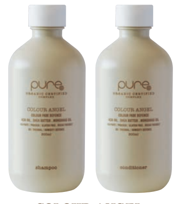
COLOUR ANGEL SHAMPOO / CONDITIONER