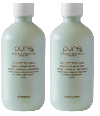
UP.LIFT VOLUME SHAMPOO / CONDITIONER