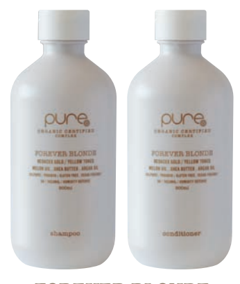
FOREVER BLONDE SHAMPOO / CONDITIONER

COLOUR FADE DEFENCE ANTI-AGEING AND REJUVENATING NO YELLOW / GOLD BLONDES WEIGHTLESS VOLUME AND SHINE