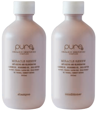
MIRACLE RENEW SHAMPOO / CONDITIONER