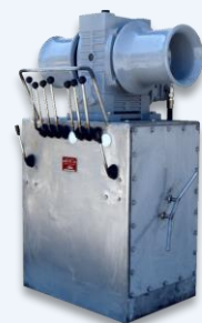
Hydraulic Capstan/Windlass (mounted on a stainless-steel console)