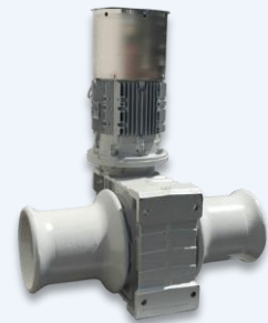
Electric Capstan/Windlass (not mounted on a console)