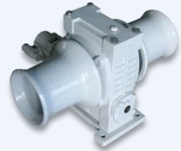
Hydraulic Capstan/Windlass (not mounted on a console)