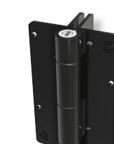
Two side-fixing legs for added strength KF3L2*