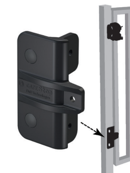
GateStop™ for metal or wood gates TCGS3