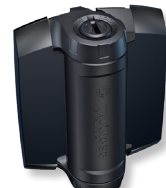
TruClose® Heavy Duty for metal gates TCHD1A53BT