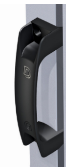
GateHandle™ for metal or wood gates LL3GH