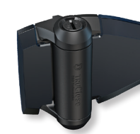
TruClose® Regular for metal post to wood gate TCA2S3BT