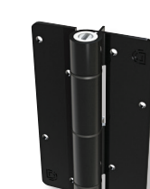
Alignment ridges for easy installation KF3*