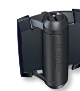
TruClose® Regular for metal gates TCA1S3BT