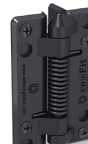
KwikFit™ Self-closing Hinge KF3S