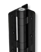
25mm leaf width Post or wall mount KF3A1BL