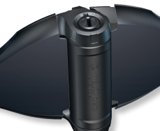
TruClose® Heavy Duty for large wood gates TCHD2L1S53BT