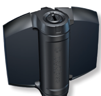
TruClose® Heavy Duty for metal or wood gates TCHD1S3BT