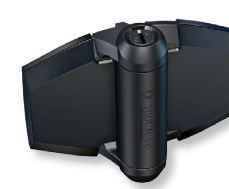
TruClose® Regular for wood gates TCA3S3BT