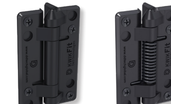
KwikFit™ Plain Pivot Hinge KF3P