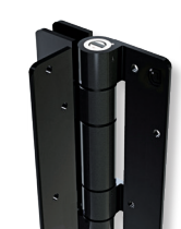
Post or wall mount KF3ABL*