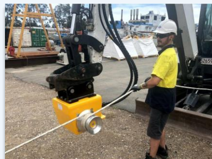
Quick-Hitch Capstan Winch in Operation