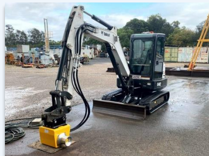
Quick-Hitch Capstan Winch Mounted on an Excavator