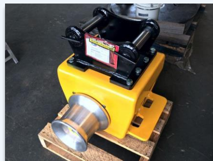
Quick-Hitch Capstan Winch with Adapter