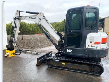
Easy to Attach and Remove