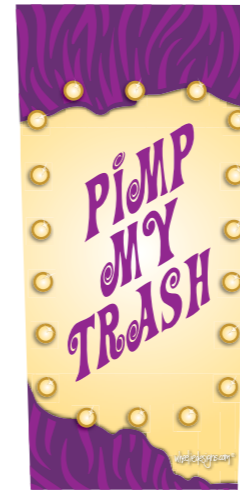
Pimp My Trash 1013