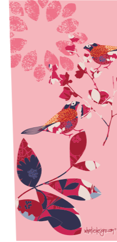
Pretty In Pink 1020