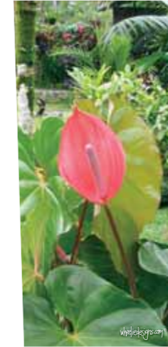
Bali Delight 1002