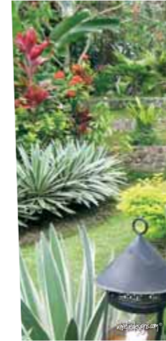
Zen Garden 1001