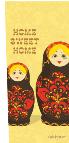
Home Sweet Home 1014