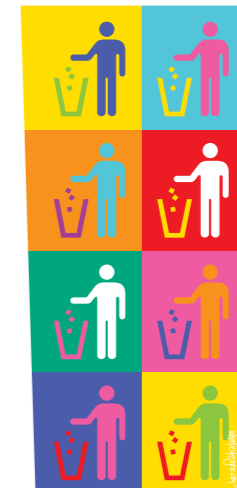
Warhol Waste Policy 1024