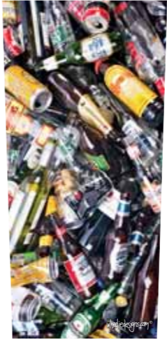
Hangover Bin 1010