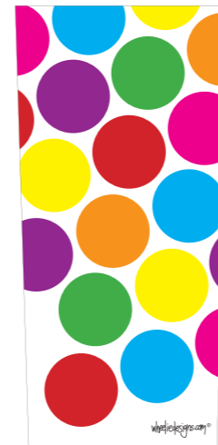
Hokey Pokey 1016