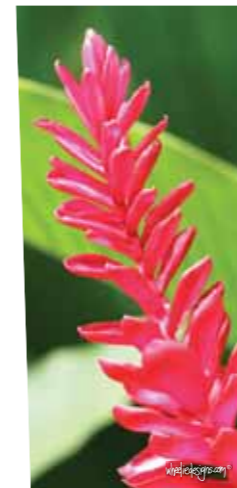
Ginger Spice 1004