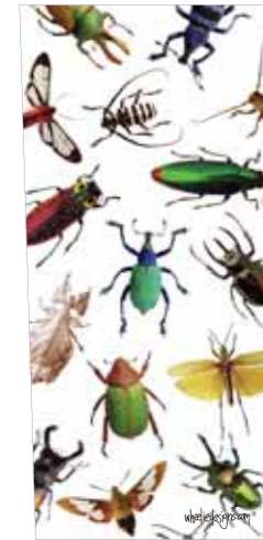
Creepy Crawlies 1015