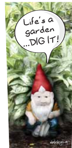
Life's A Garden 1017