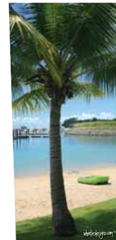
Lazy Days 1006