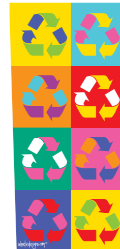
Recycle Warhol 1023