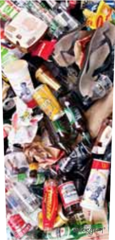
Bachelor Bin 1009