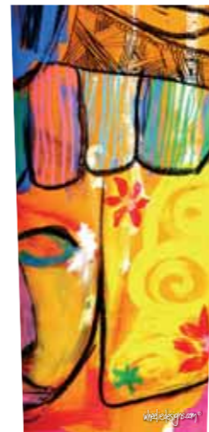
Mexican Inca 1022