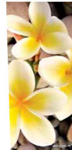
Frangipani Fantasy 1005