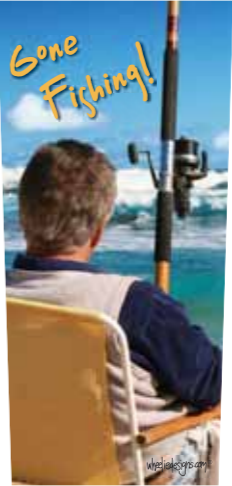
Gone Fishing 1011