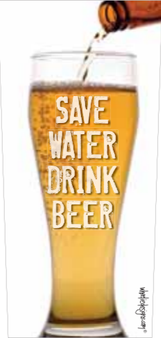
Save Water 1008