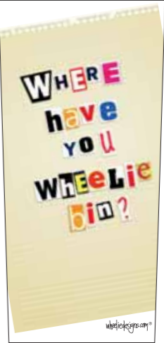
Wheelie Bin? 1012