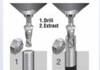
Product No. 7017P