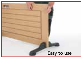
Easy to use