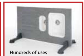
Hundreds of uses