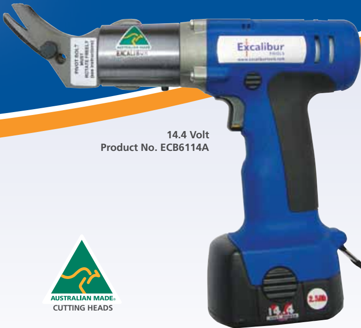
14.4 Volt Product No. ECB6114A