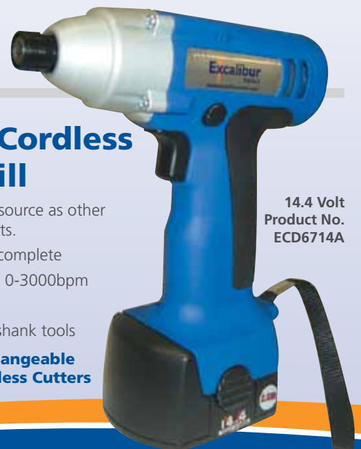
14.4 Volt Product No. ECD6714A

Battery Pack interchangeable with Excalibur Cordless Cutters