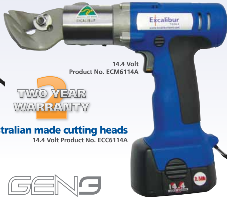
14.4 Volt Product No. ECM6114A