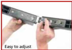
Easy to adjust