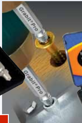
Product No. 8520P (Grabit® made in China)