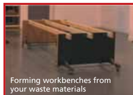
Forming workbenches from your waste materials