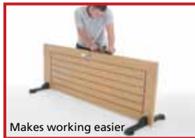
Makes working easier