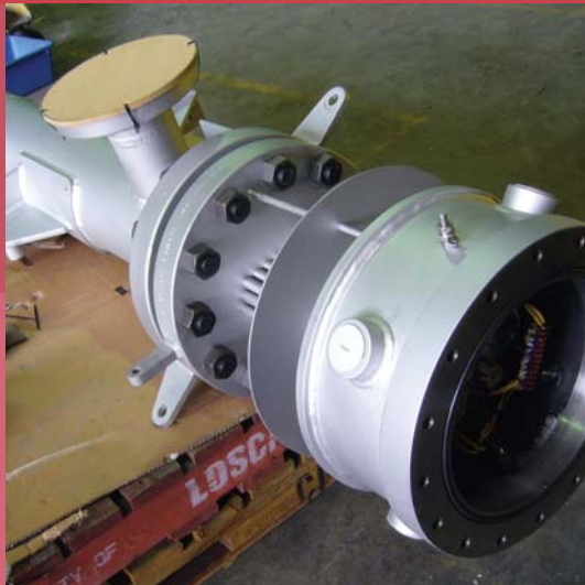
Element Bundle and pressure Vessel.

Gasco's Grimwood Heating Range now provides complete electric heating systems to complement its range of combustion products. Circulation Heaters and Tank Heaters are available to heat virtually any gas or liquid.