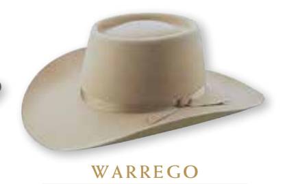
Brim: 102mm Sizes: 53-61cm Colours: Sand.