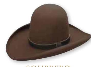
SOMBRERO Brim: 118x127mm (OC) Sizes: 55-63cm Colours: Fawn.