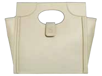
Ivory, silver or gold accessories