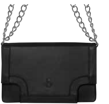
Matte black, nickel metal chain