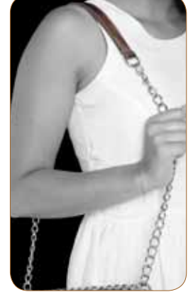
With leather shoulder strap