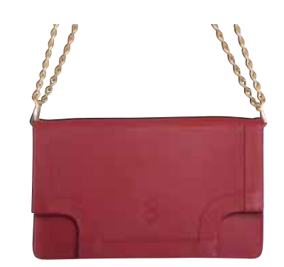
Poppy red, gold aluminium chain