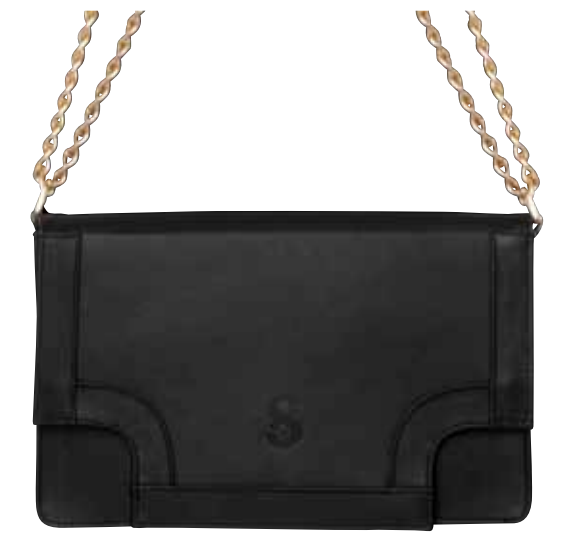
Matte black, gold aluminium chain