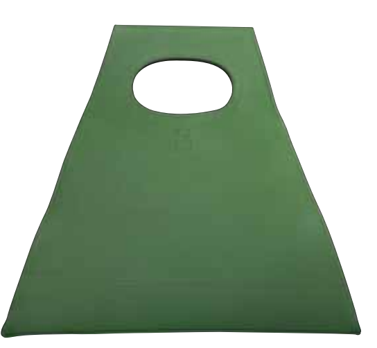
Peridot, silver or gold accessories