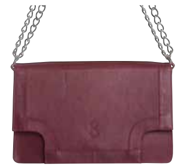
Vintage red, nickel metal chain