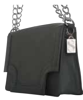
Vintage green, nickel metal chain