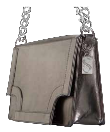
Pewter, nickel metal chain