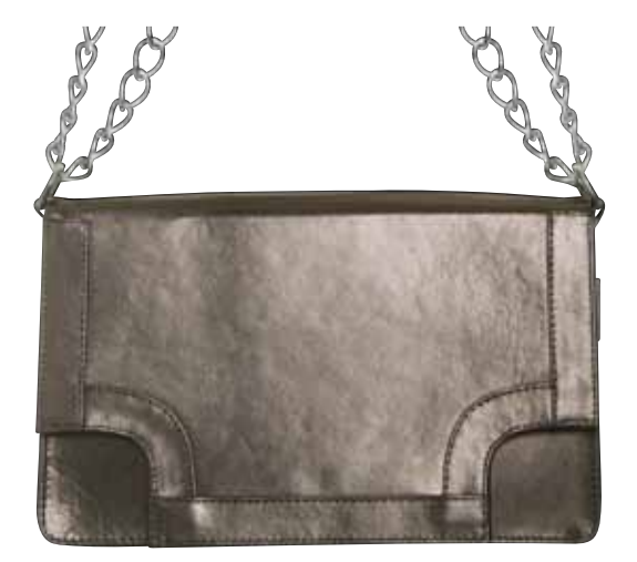
Pewter, nickel metal chain