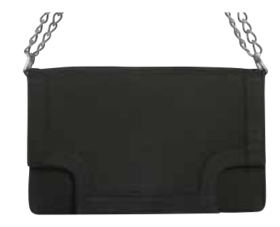
Vintage green, nickel metal chain