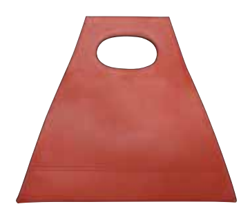
Tangerine, silver or gold accessories