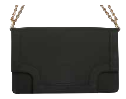
Vintage green, gold aluminium chain