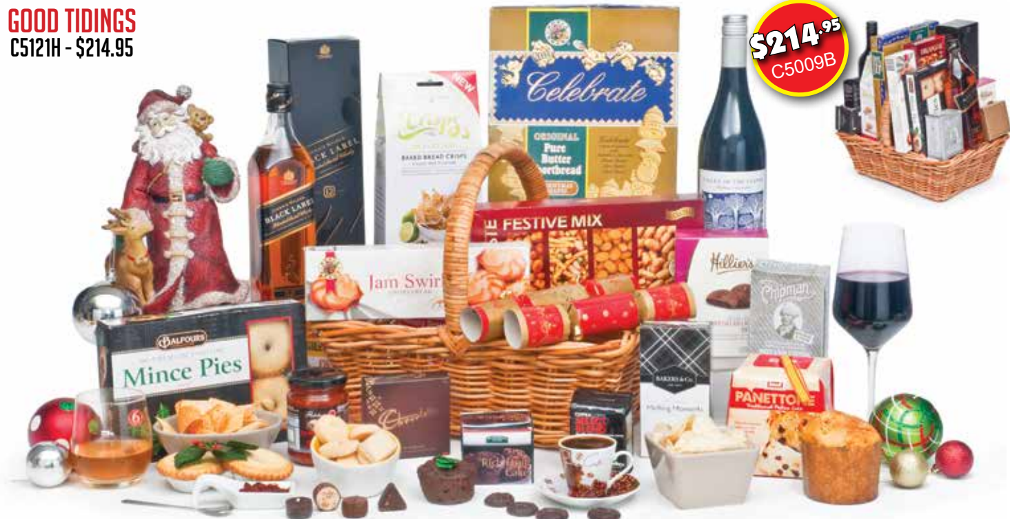
Ital Panettone Traditional Festive Cake 100g, Traditional Foods Rich Fruit Cake 80g, Koala Brand Christmas Shaped Pure Butter Shortbread 450g, Bakers & Co. Passionfruit Melting Moments 60g, Koala Brand Jam Swirls Shortbread 100g, Mountain Bread Lime & Black Pepper Crisps 50g, Fletchers Tomato & Basil Salsa 250g, Trutaste Festive Nut & Cracker Mix 280g, Thomas Chipman Rosemary & Thyme Organic Potato Chips 20g, Hillier's Turkish Delight Bites 100g, Chocolatier Pure Indulgence Assorted Chocolates 40g, Balfours Premium Fruit Mince Pies 400g, Coffex Select Blend Pure Ground Coffee 70g, Johnnie Walker Black Label 700ml and Valley of the Giants Cabernet Merlot 750ml. All 15 products are displayed in a Shopper Basket finished with decorative ribbon.