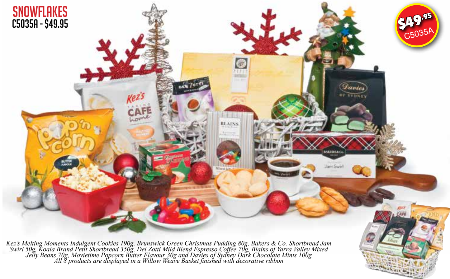
Kez's Melting Moments Indulgent Cookies 190g, Brunswick Green Christmas Pudding 80g, Bakers & Co. Shortbread Jam Swirl 50g, Koala Brand Petit Shortbread 350g, Del Zotti Mild Blend Espresso Coffee 70g, Blains of Yarra Valley Mixed Jelly Beans 70g, Movietime Popcorn Butter Flavour 30g and Davies of Sydney Dark Chocolate Mints 100g All 8 products are displayed in a Willow Weave Basket finished with decorative ribbon