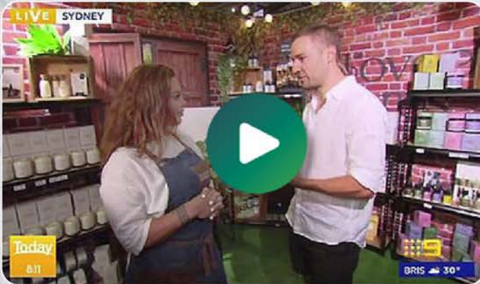
Australian Made licensee Beloved Scents interviewed on Chanel 9 Today Show