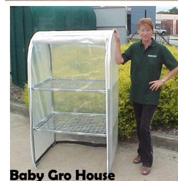
Baby Gro House