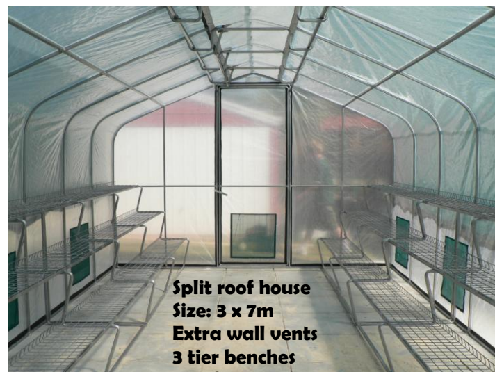
Split roof house Size: 3 x 7m Extra wall vents 3 tier benches