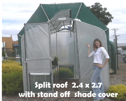
Split roof 2.4 x 2.7 with stand off shade cover