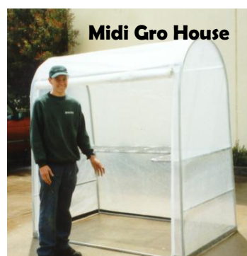
Midi Gro House