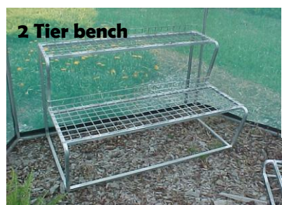
2 Tier bench