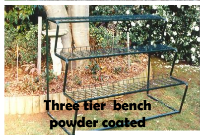
Three tier bench powder coated