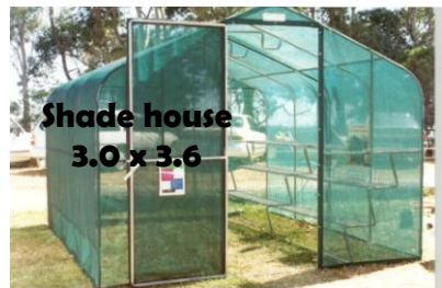
Shade house 3.0 x 3.6