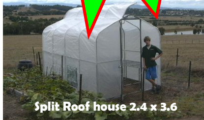
Split Roof house 2.4 x 3.6